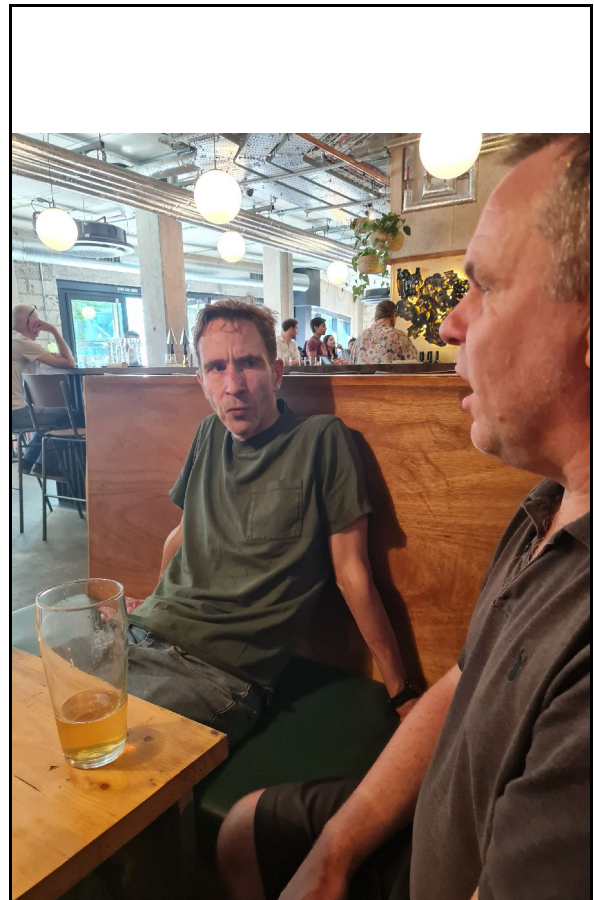
WARWICK ON THE BEER MILE