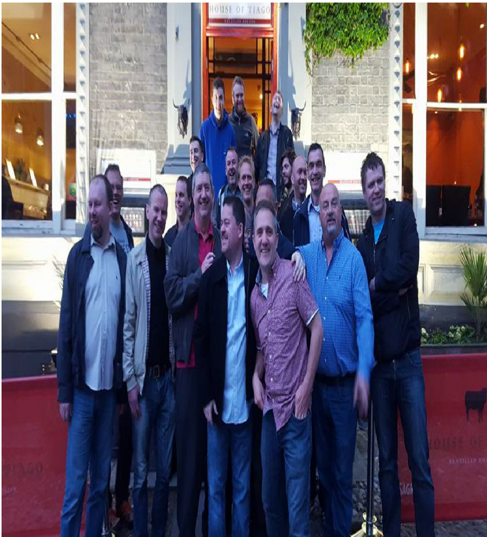
MERRY MEN IN NARWICH