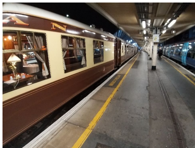
THE BROOKSIE VICTORY TRAIN ROLLS IN

Temperature next session: Warm Predicted wind speed next session: Light