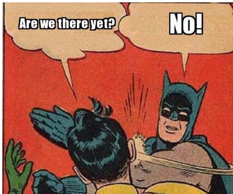
RUSSIAN TROOPS BEING SWATTED AS THEY LOSE THEIR WAY

Temperature next session: Cold Predicted wind speed next session: Light