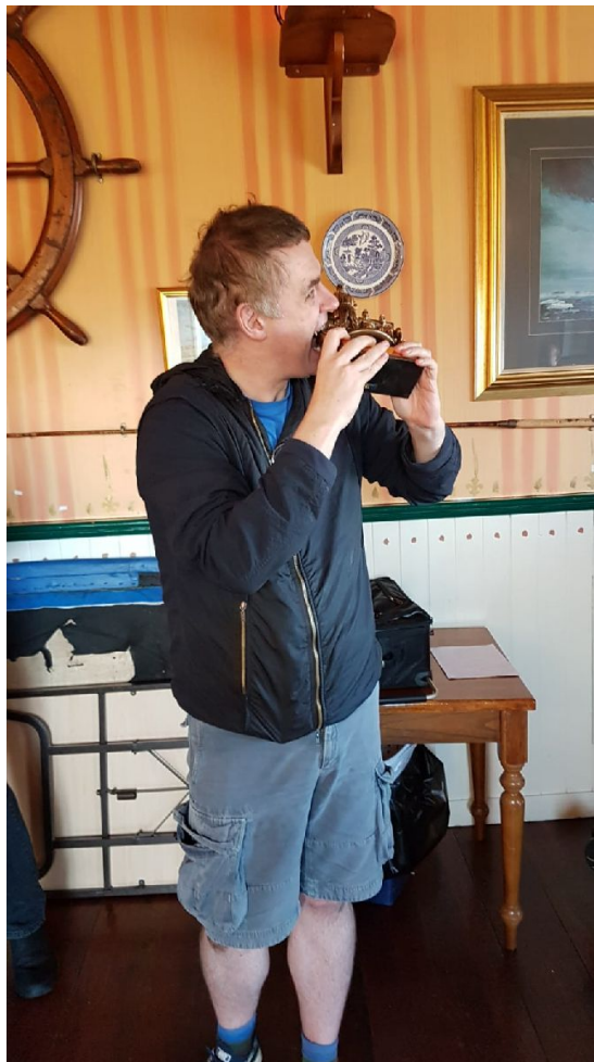
THIS MAN JUST LIVES FOR TITLES