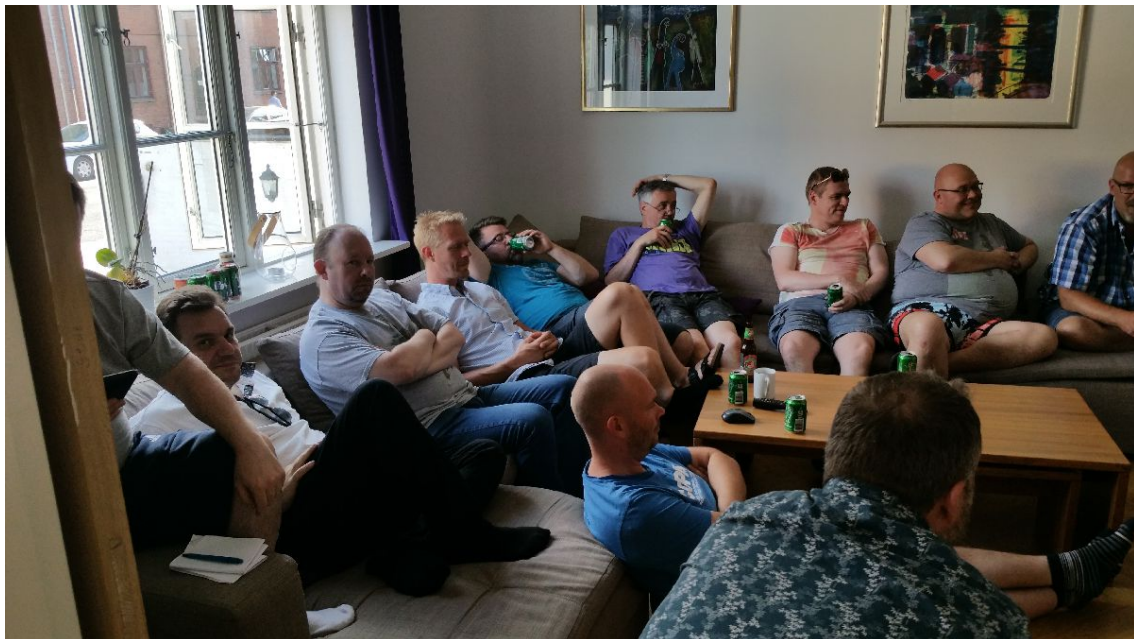
NERDS GATHER FOR THE RESULTS