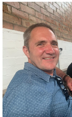
I'M GONNA BE THE CHAMP THIS TIME

Temperature next session: Cool Predicted wind speed next session: Brisk