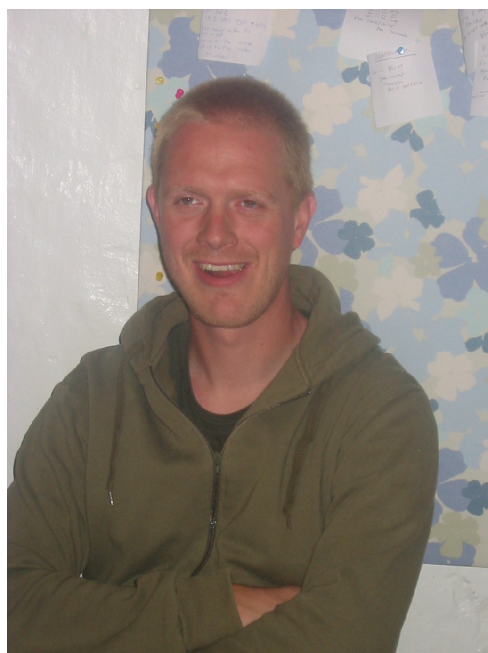
FRALKA ON THE WAY UP AGEING ON THE WAY DOWN