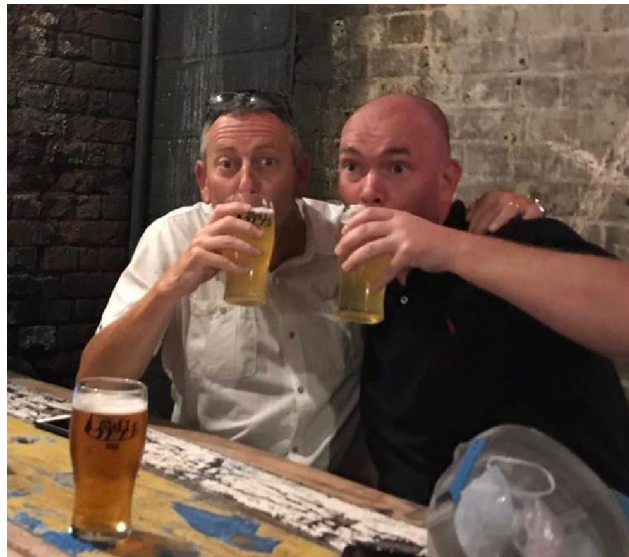
CHUCKLE BROTHERS TOAST THEIR CUP MEETING

Just a reminder. for teampick users. Please get the match you are playing correct. Putting your cup game down as a friendly means I have to come out of the program to make sure i haven't made a mistake. It isn't rocket science to change the competitor that you are playing in. PLEASE!!